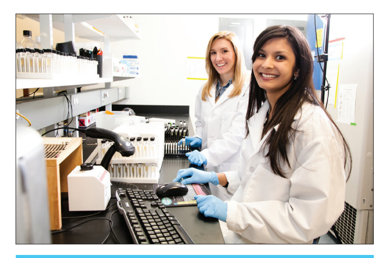
Addgene, a nonprofit plasmid repository, is rapidly growing with more than 65 employees in its Cambridge office.