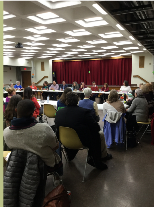
Organizational Partnering Roundtable at the Berkshire Athenaeum