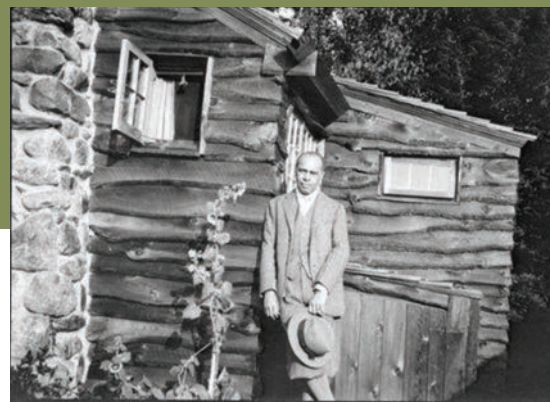
James Weldon Johnson, standing behind his writing cabin in Great Barrington at "Five Acres," his summer property off Alford Road.

Nonprofit Center of the Berkshires has been an incredible resource and mentor for our fledgling not for profit. We at Roots & Dreams and Mustard Seeds are approaching our fifth year since instatement and we're looking for resources and insight to grow our organization from a volunteer start-up to a more foundational not for profit with paid staff. We are so thankful for the ways Nonprofit Center of the Berkshires has come alongside us to support us in reaching pinnacle goals that will help us have more impact in creating equity and justice here in the Berkshires! If your not for profit needs guidance, direction, and/or resources, Nonprofit Center of the Berkshires is your perfect match. Give them a call! — Board Member, Roots & Dreams