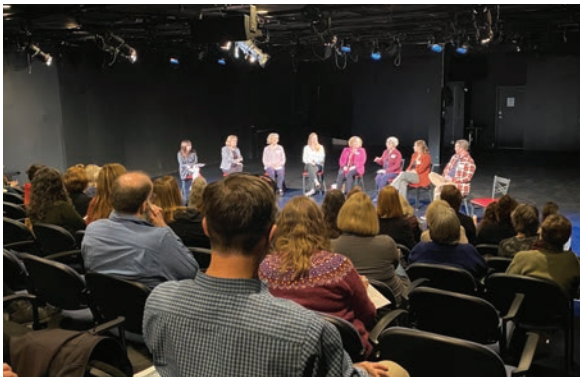
"Meet the Donors" networking event at Barrington Stage's Blatt Center.