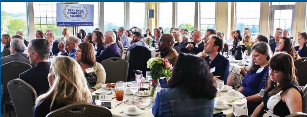
Berkshire Nonprofit Awards Breakfast crowd