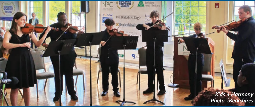
Kids 4 Harmony

Thank You! for making this celebration possible