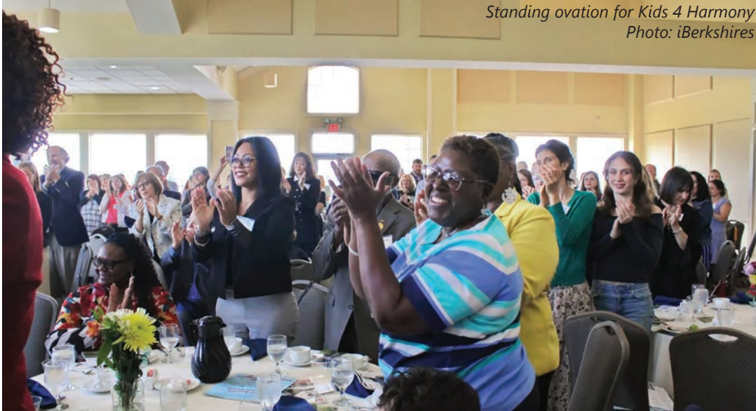
Standing ovation for Kids 4 Harmony

HAPPY! That’s what we observed on the morning of the 6th Annual Berkshire Nonprofit Awards – 200 people extraordinarily happy to be together to honor our colleagues and celebrate our collective nonprofit work and workforce. Everyone was smiling, clapping, laughing, chatting. Moving tributes to our honorees drew quiet murmurs of appreciation, enthusiastic applause, and wide smiles.