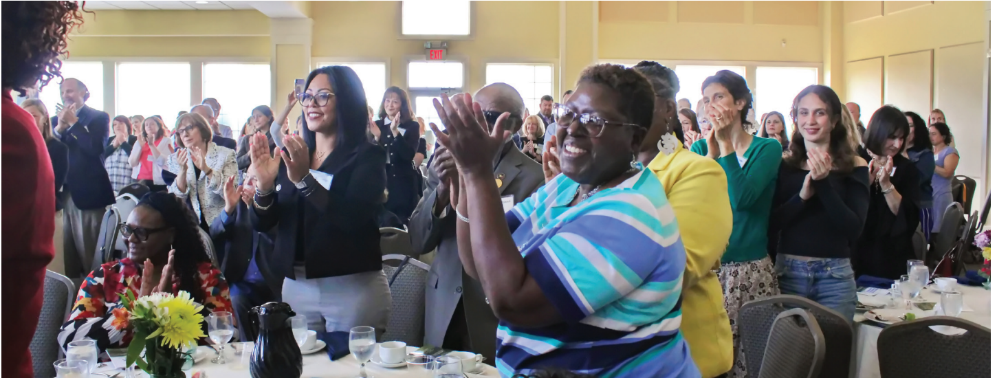
A standing ovation for Kids 4 Harmony at the 6th Annual Berkshire Nonprofit Awards!

Now in its seventh year, the Nonprofit Center of the Berkshires continues to experience steady and manageable growth.